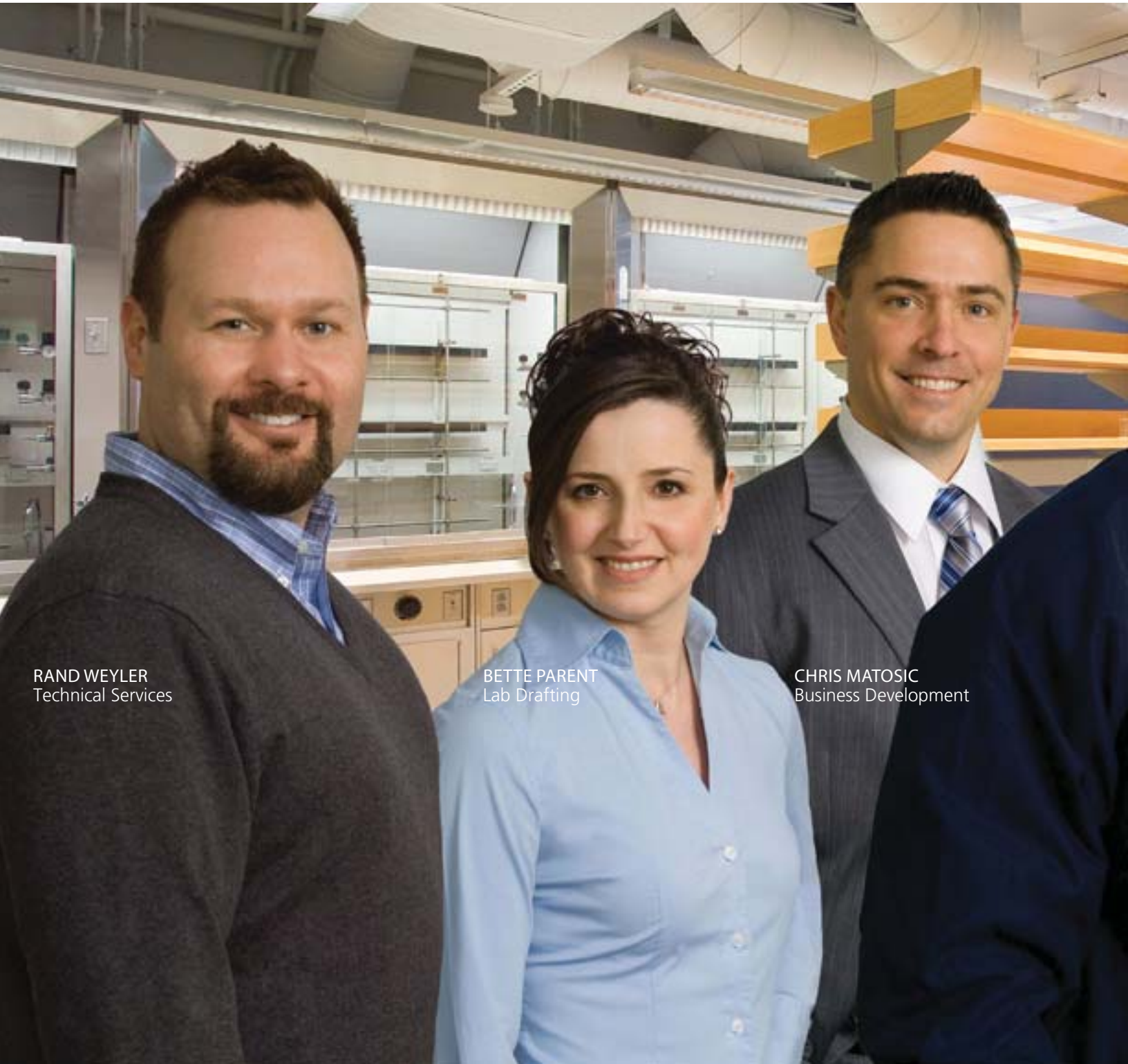
RAND WEYLER Technical Services

A straight talk, satisfaction first service philosophy delivers assurance that New England Lab will do what we say and will always strive to make things right for you. We spend the time up front with you to set clear scope and timeline expectations. Our experience, team-approach to project management, and detailed shop drawings help provide smooth coordination with other trades. We sweat the details and are as tough on the punch list as you are. To us “lab-tested” means that you get the optimal information, design, and furniture you require—all guided by a knowledgeable, flexible and reliable team who understands that what we deliver is only as good as how and when we deliver it.